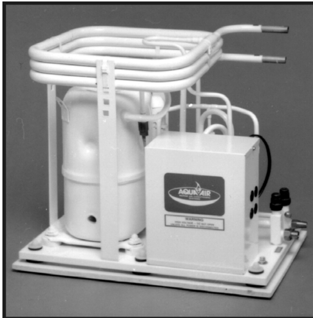
AQFH-30, 36 & 48

The AQFH models are large capacity remote condensing units designed to be matched with single or multiple cooling/heating units. It's simple design and ample condenser makes it the perfect solution where high capacity, efficiency and reliability are required. With standard mechanical control or TW2 microprocessor control options, and a variety of size and input power configurations, there is an AQFH model for virtually all new and refit applications where high capacity units are specified.