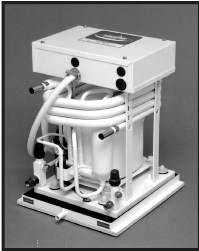
KH-05, 07, 10, 12 & 16

The redesigned KH series condensing units have the smallest footprint available in the industry. These rugged, highly efficient, reverse cycle units have an integrated drain pan and a removable electric box that can be mounted up to 6' away. With below deck space at a premium in the modern boat, there is a recognizable size benefit in the KH Model which is 32% smaller than the competition. These versatile models can fit snug spaces or can be racked to maximize vertical space, while at the same time presenting more options in cabin space zone temperature control than ever before. These units can be matched to a host of Cooling/Heating units available from Aqua-Air.