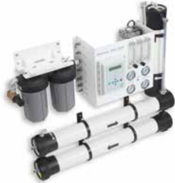
SZ 3000Z DPPC model shown

Purifies Dock Water & Water Produced by Watermakers