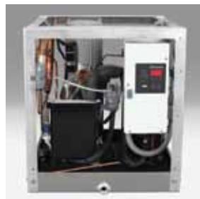
Ventilated cover panels can be removed for service access from any side.