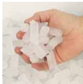
Special cylindrical ice shape maximizes ice density for greater cooling.