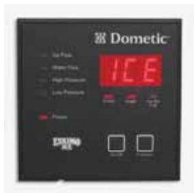
The easy-to-use Smart Logic digital control monitors all system functions.