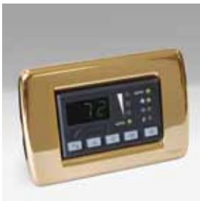
Elite keypad/display shown above with Vimar Idea bezel; at top of page with Vimar Eikon bezel. ISO 9001:2008

The Elite control meets or exceeds applicable ABYC, U.S. Coast Guard Regulations and CE Directives.