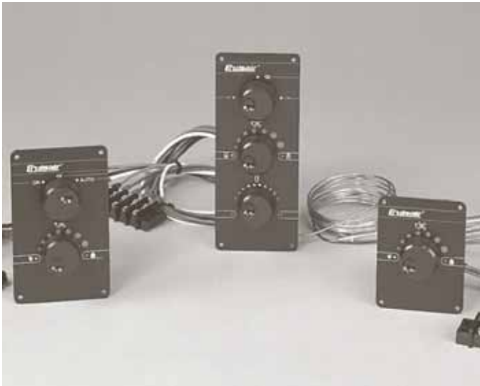
SA4A-ZB, SA3-ZB10, SA4-ZB Models Shown