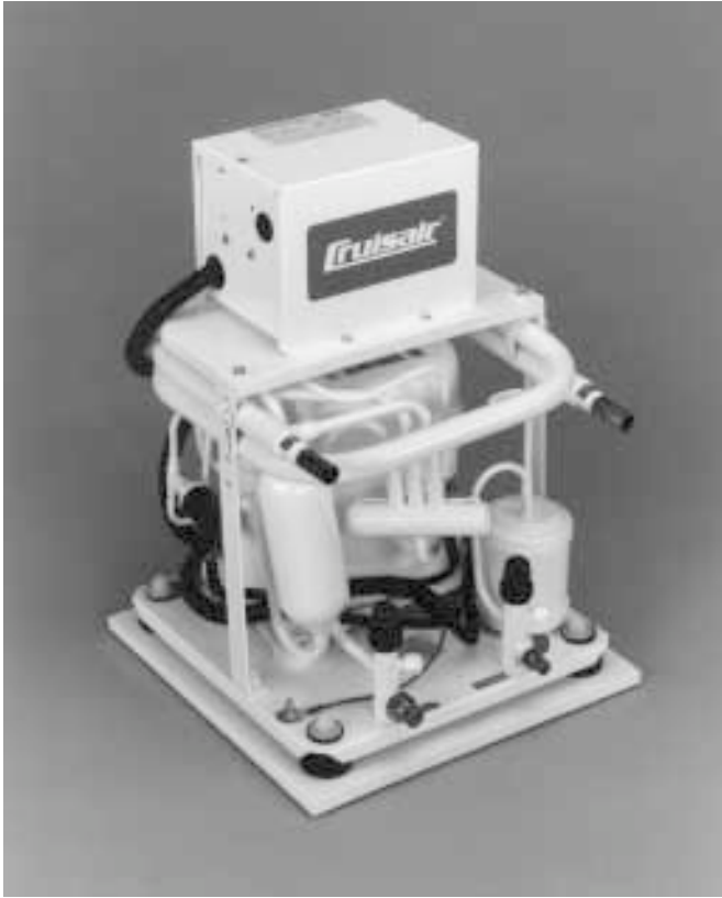
J10 Condensing Unit Shown