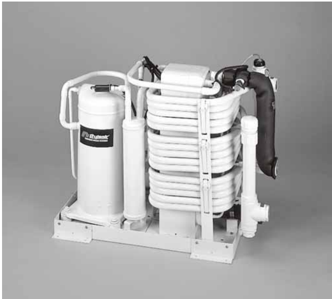
MTC 72DC Shown