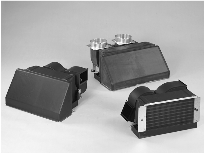
EBL16, EBLP16C, and EBULP24C Units Shown