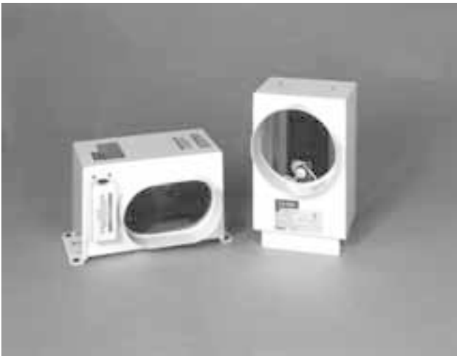
HMDL2-7 & HMBL2-7 Units Shown