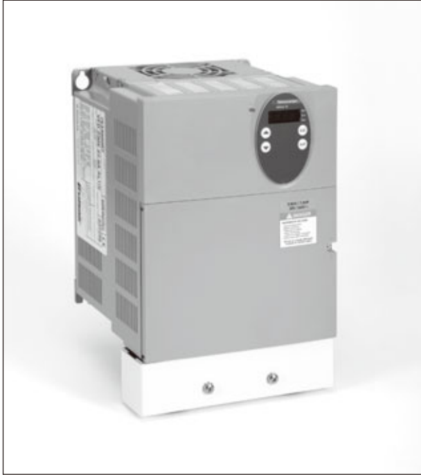
VFD Unit Shown