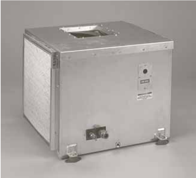
EBD Unit Shown