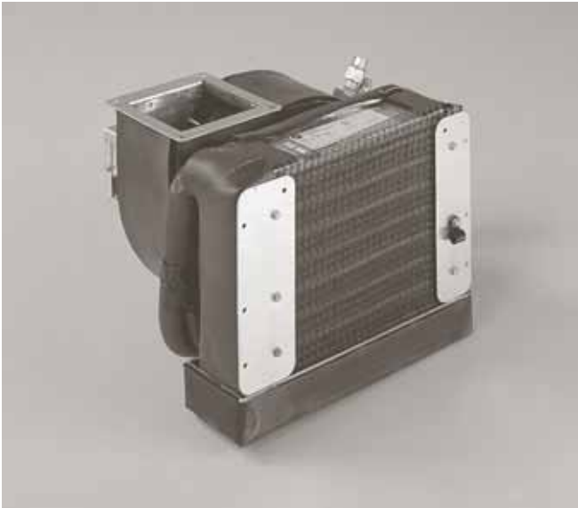
EBU7 Unit Shown