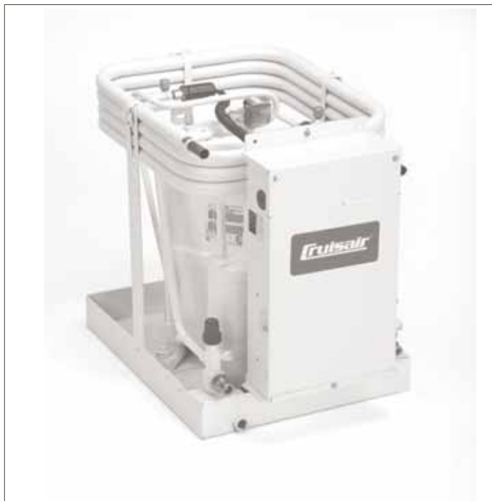
RX24 Condensing Unit Shown