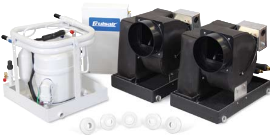
Directional diffuser jets