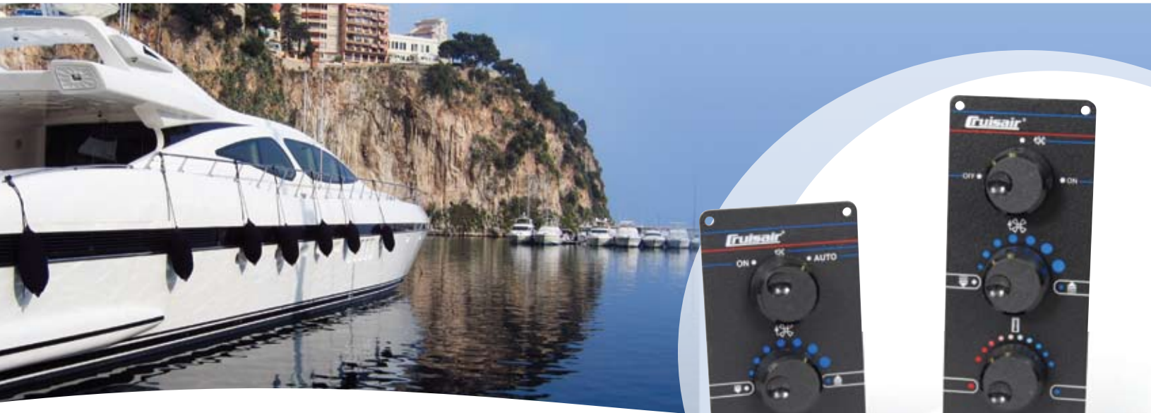
SA4A-ZB & SSA3-ZB shown

Cruisair electromechanical rotary-knob switch assemblies provide conventional control over basic air conditioning functions. Both 115V and 230V switches are available. The standard design is an aluminum plate covered with a modern black plastic overlay with text and graphical representations of the various functions. Many different configurations are available: