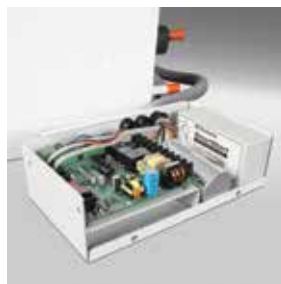
The electrical box has space for the optional SmartStart soft starter.