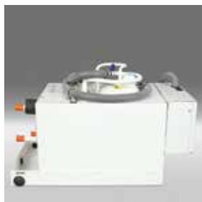
The electrical box can be mounted on the rear of the unit for better installation flexibility.

The electrical box comes installed on top of the unit. However, it has a short harness and hardware allowing the installer to easily move it to the rear of the unit if desired.