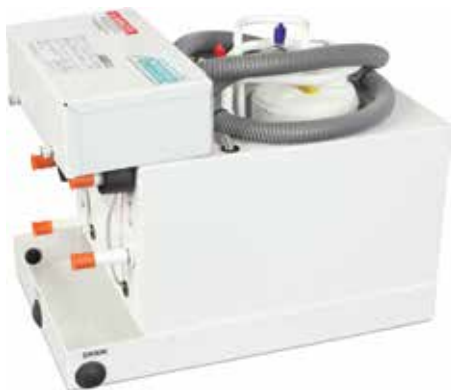
CHCG20Z shown with the electrical box mounted to the top (standard).

Marine Air's Chiller Compact series is ideal for larger boats in the 45-70 ft. (15-20 m) range. Available in capacities of 16,000 and 20,000 BTU/hr, the Chiller Compact uses circulated water in a closed loop in place of copper refrigerant tubes. The innovative, space-saving compact base of the Chiller Compact was designed to allow individual modules to be multiplexed to provide precise capacity requirements for any application.