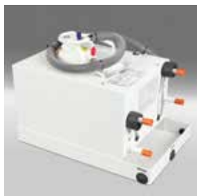
Extended drain pan collects and removes condensate that drips from water connections.